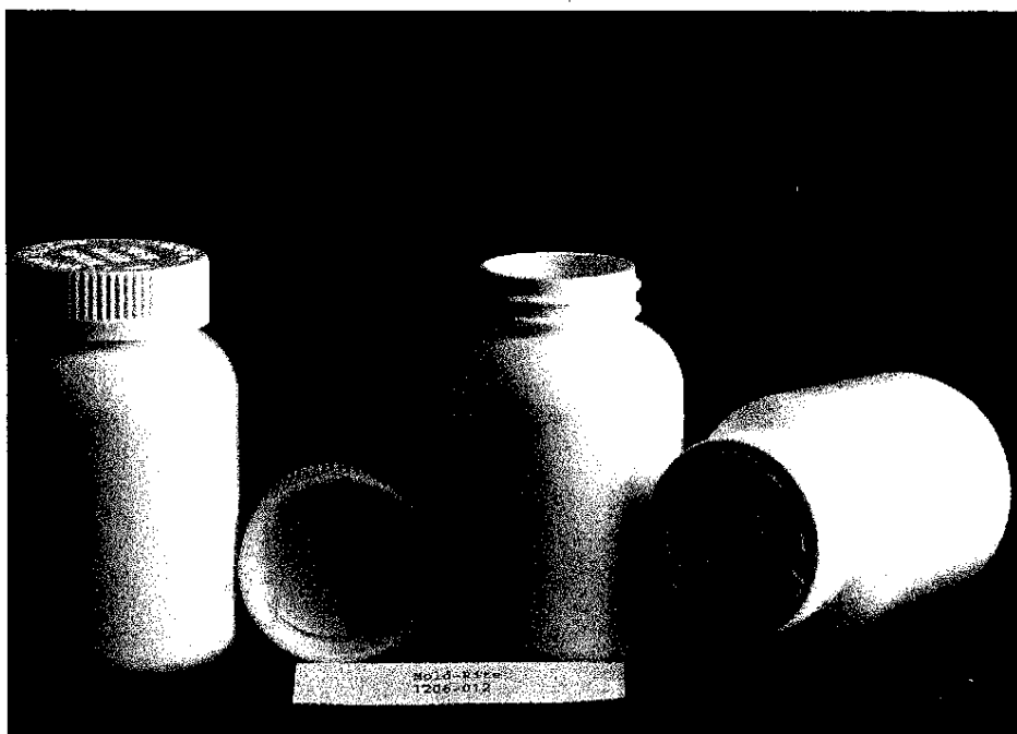
45mm CONTINUOUS THREAD CLOSURE ON A 250cc HDPE ROUND BOTTLE Figure 1

Mold-Rite Plastics Inc. 1206-012 November 4, 1998